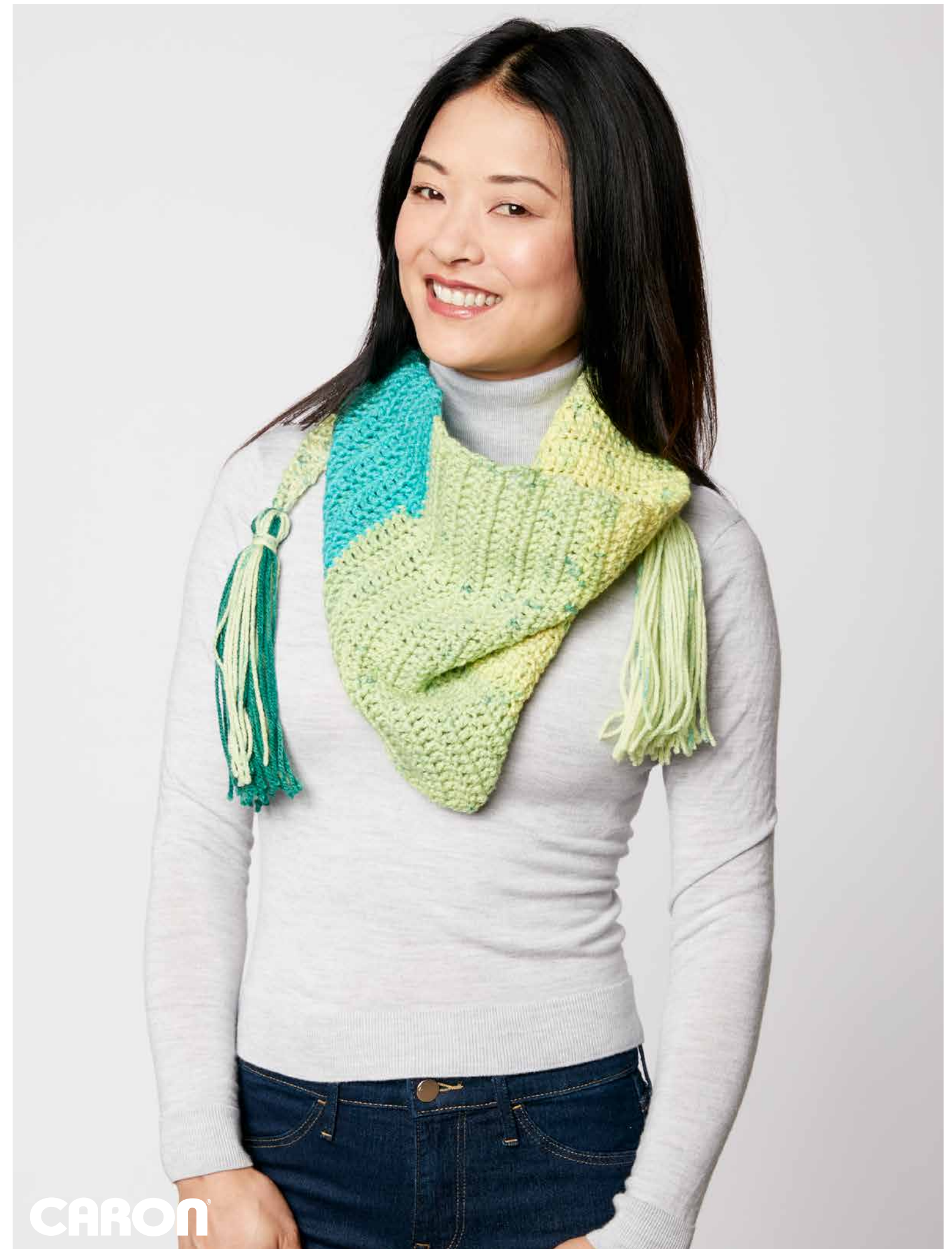
Crochet Kerchief Scarf crocheted in Caron® Cakes™ in Macaron (above) & Lemon Lime (right).