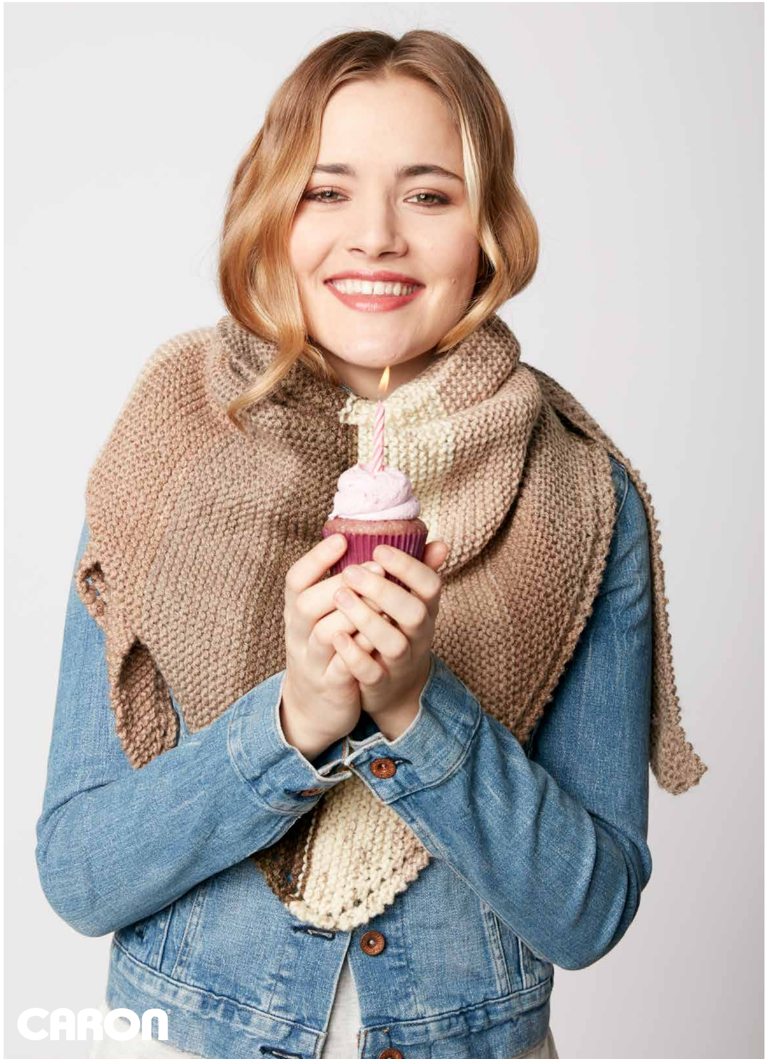
Knit Triangle Shawl knit in Caron® Cakes™ in Faerie Cake (above) & Boston Cream (right).