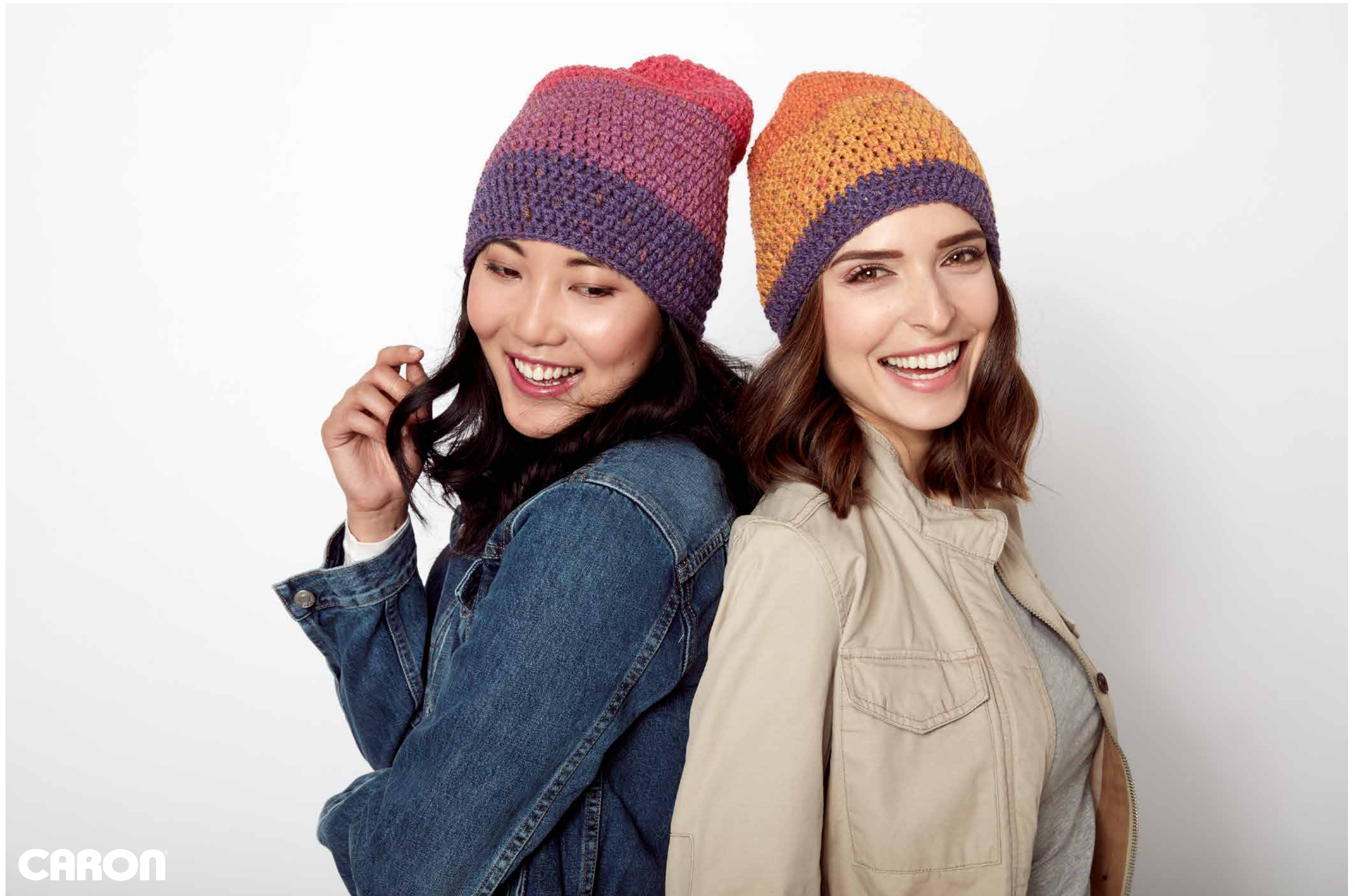
Sloouchy Crochet Beanie crocheted in Caron® Cakes™ in Blueberry Cheesecake (above) & Funfetti (right).