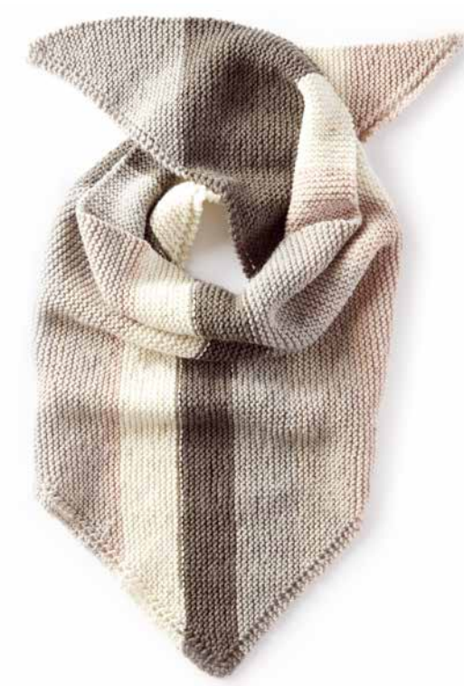
Cookies & Cream